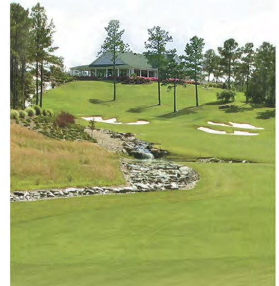
18th at Granada