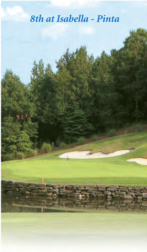
8th at Isabella - Pinta